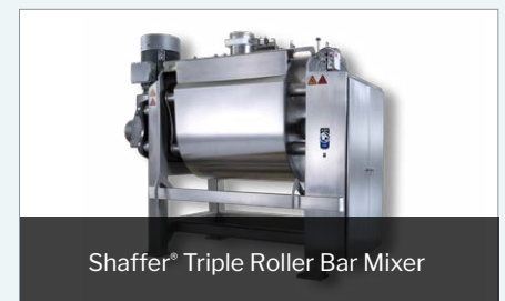
Shaffer ® Triple Roller Bar Mixer

Shaffer offers the most extensive and innovative line of horizontal mixers in the baking industry. Mixers are available with triple roller bar, single sigma, double sigma, or high shear agitators and are custom designed with an enclosed frame, open frame, and open frame hybrid designs. Shaffer engineers every mixer to meet exact product and facility needs to help our customers save money and increase quality.