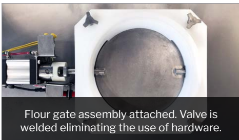
Flour gate assembly attached. Valve is welded eliminating the use of hardware.

The flour gate assembly is compatible with both standard and BFM flour socks. The assembly can be retrofit to existing mixers with some minor adjustments to the existing canopy.