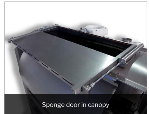
Sponge door in canopy

For additional information or to request a quote, call +1.937.652.2151 or email info@shaffermixers.com .