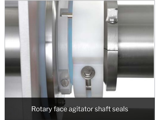
Rotary face agitator shaft seals