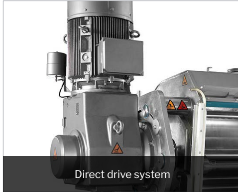
Direct drive system