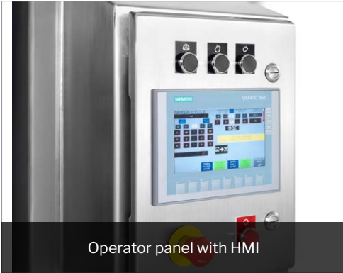
Operator panel with HMI